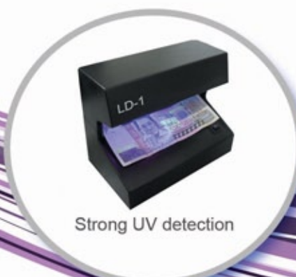
Strong UV detection